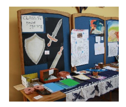
Class 6 display from their Ancient Rome Main | esson