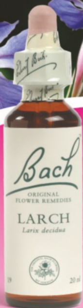
Larch: Encourages initiative

Learn about Bach Flower Remedies & their application in everyday situations