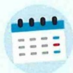
NZ Immunisation Schedule