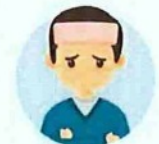
Naturopathic Health Options

Saturday, September 29th, 106 Queen Street East, Hastings, Hawkes Bay