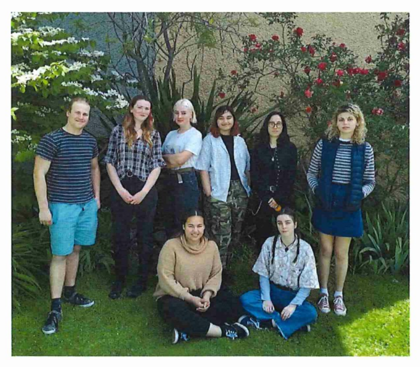
Class 12 Social Studies students

Free entry Tuesday 29 October 2019 4:30pm till 6:30pm Taikura School Hall 505 Nelson Street North, Hastings