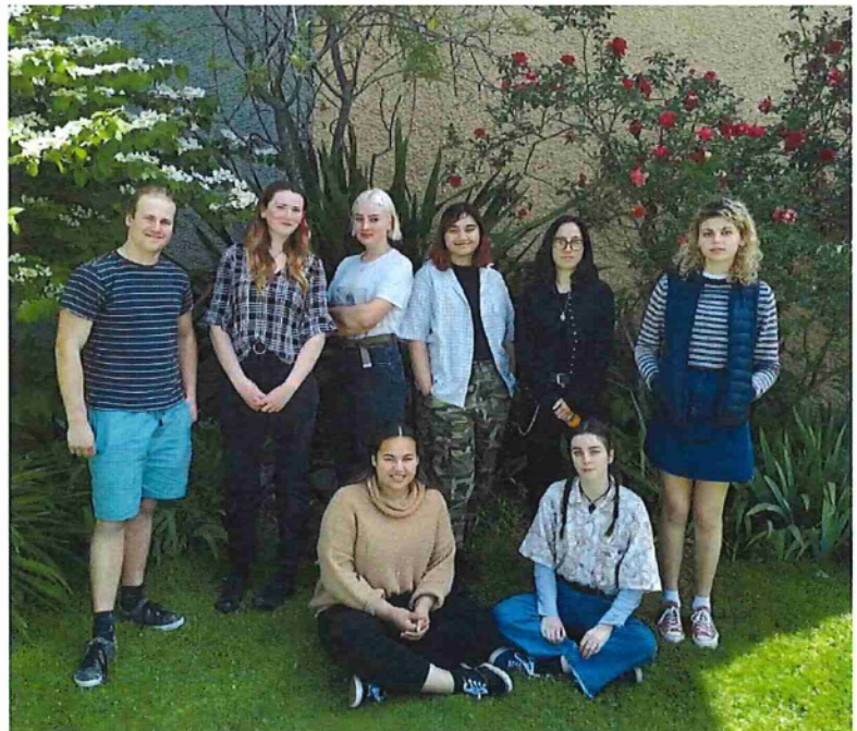
Class 12 Social Studies students