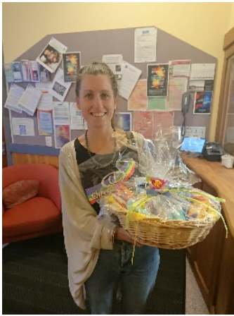
Table And Chair Winner