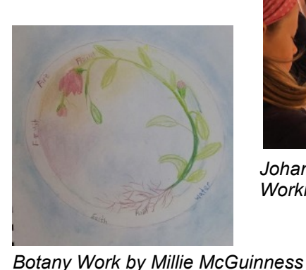
Working - Class 5