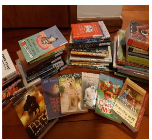
Some of the new books covered in the last few weeks.