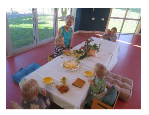
♪ To Harvest! To Harvest! We help the Farmers gather in, the pumpkins fat, the apples red, prepare the harvest meal.