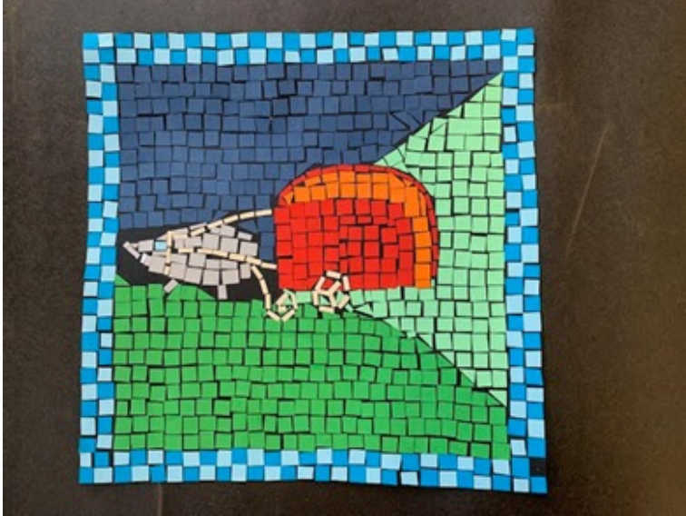
Amelia Diedericks Class 6

For the Class 6 teacher it is fascinating and informative to watch each student's relationship to the various stages of this activity.