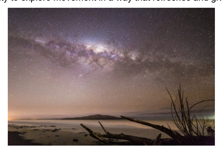
Thursday 3 March at 9:00-10:00 am and Thursday 3 March at 7:00- 8:00 pm Steiner Centre corner Nelson Street and Whitehead Road

Thursday 3 March 2022 two courses of eurythmy will commence. All are welcome no matter how much exposure or experience you've had with the art of eurythmy. This is an opportunity to explore movement in a way that refreshes and gives vitality.