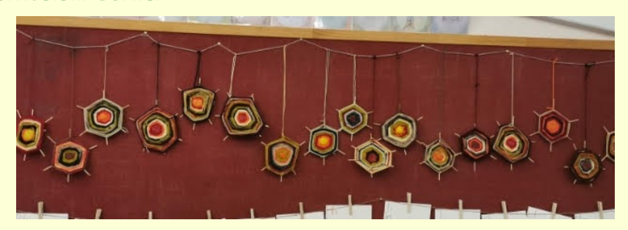
Inspired by Autumn, last week Class Two wove these beautiful God's Eyes.