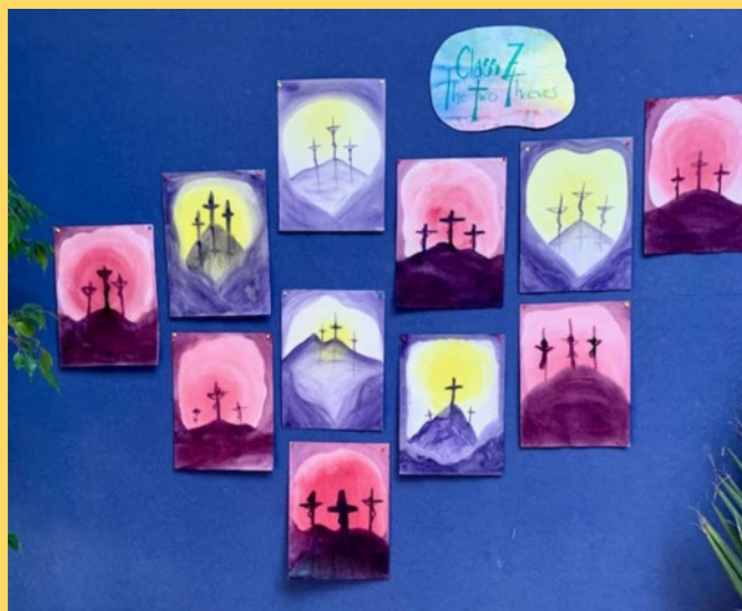
Paintings by Class 7

The festival table is not discussed with the students - it is simply there for them to enjoy.