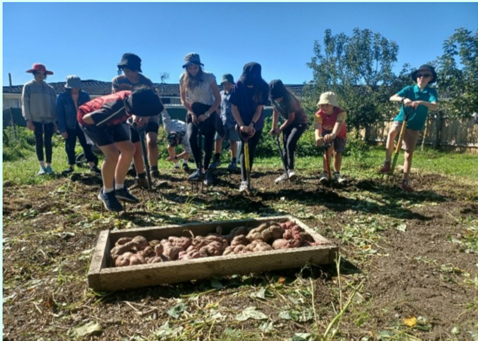
Ākonga from Class 6.

Matariki's long journey across the night sky is now complete. It is now time for Matariki to rest and take those that have departed over the last year on their final journey, until this whānau o Matariki rises again and those souls become part of the myriad of stars in the night sky! The disappearance of Matariki also heralds the end of the harvest of the crops. This week Classes 4, 5, and 6 took part in harvesting the kūmara. This was an exciting event for the students as they unearthed the rich bounty from our maara (gardens). The kūmara will be stored and some will be kept as seedling kūmara and others will be part of the kai for our Matariki celebrations in June.