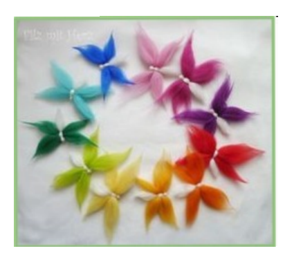
Venue - Class One Spring and its Meaning -

An opportunity for parents to explore the festivals of the year -spring.