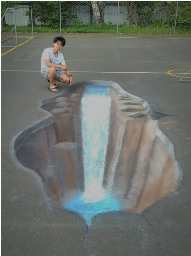
School hard court