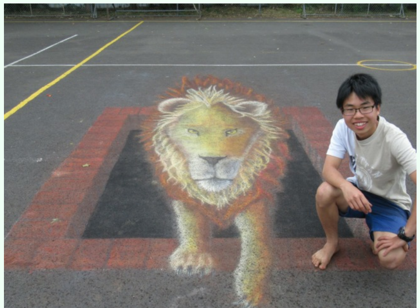
School hard court