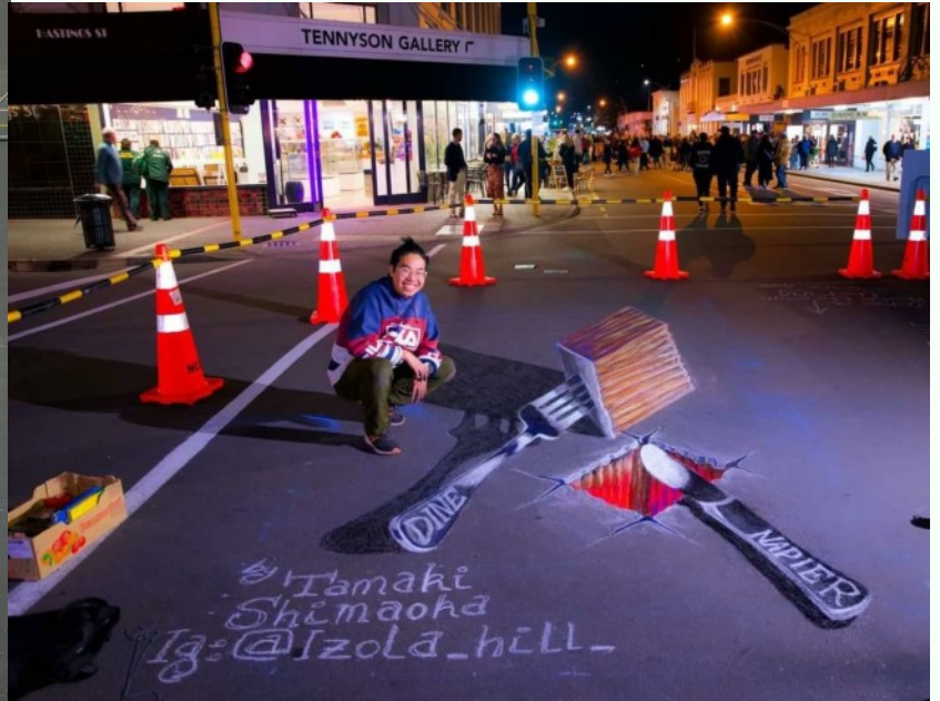
Nuit Blanche/ White Night, Napier for the Arts Festival Middle of the intersection of Hastings and Tennyson