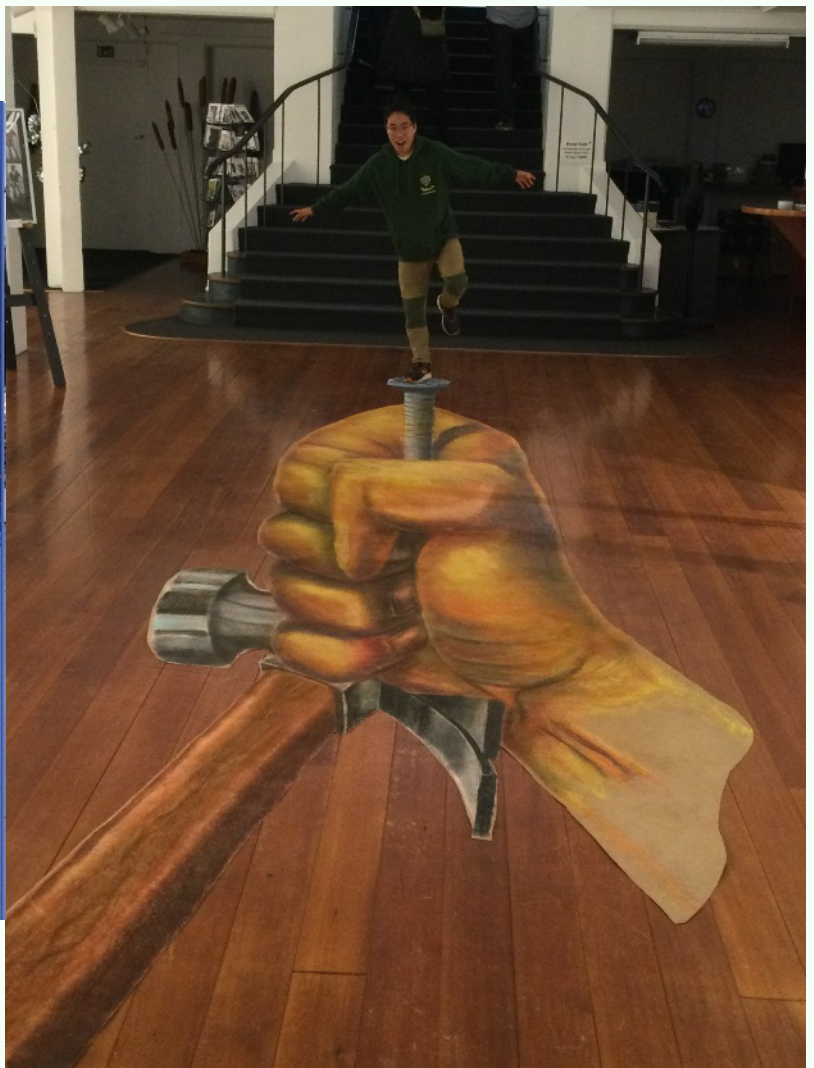
As an honorary guest artist. Year 12 local art competition at the Russell Street