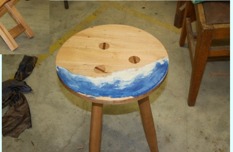
The humble stool with epoxy inlay by Pippa van Duin