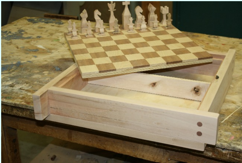
Anyone for a game of chess?