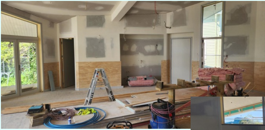
Where build update