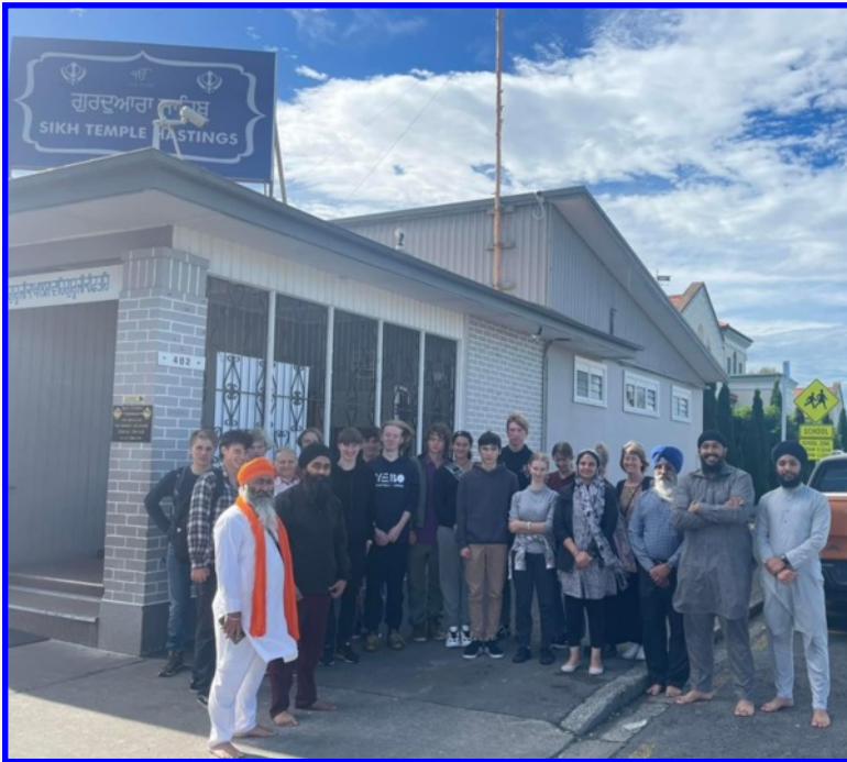
Photos from the Gurudwara Sahib

Class 11 visited the local Sikh Temple as part of the History of Religion Main Lesson. Members of the temple talked to us about their faith and then nourished the class with delicious food. We wish to thank the Sikh community for their warmth and hospitality.