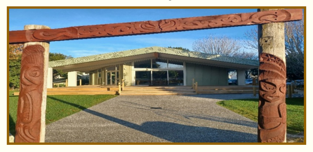
When one home dies, Another house lives!