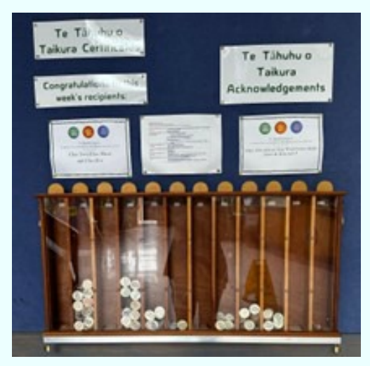
The token cupboard is displayed in our hall foyer

Individual acknowledgements for students in Class Six and above are also made. Individual tokens are recorded and once ten have been received, students are placed in the weekly prize draw. The lucky recipients can then choose from the prize box a treasure to keep, such as a cup, photo frame, needlepoint, notebook, pen, handball, drink bottle etc.