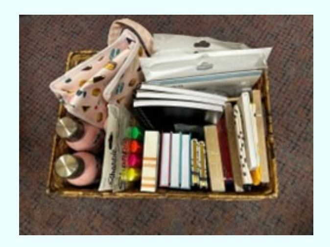
The individual prize box

Individual acknowledgements for students in Class Six and above are also made. Individual tokens are recorded and once ten have been received, students are placed in the weekly prize draw. The lucky recipients can then choose from the prize box a treasure to keep, such as a cup, photo frame, needlepoint, notebook, pen, handball, drink bottle etc.