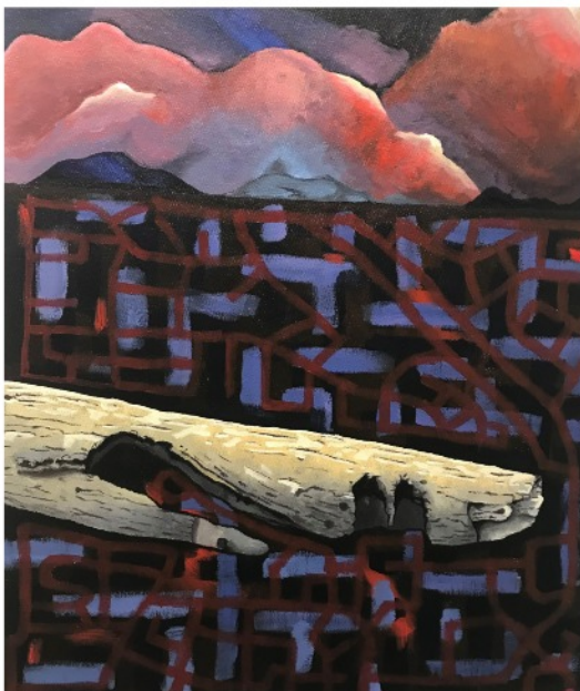
'Taikura Upstairs' Taikura Rudolph Steiner High School April 15 - 28, 2024