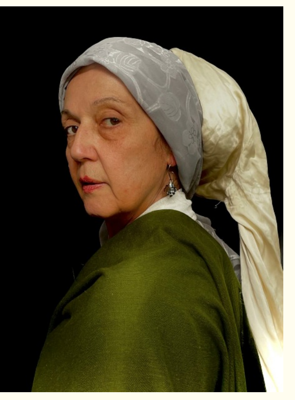
Girl?...with a Pearl Earring