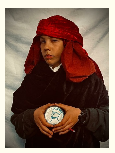
Young Man with Coin