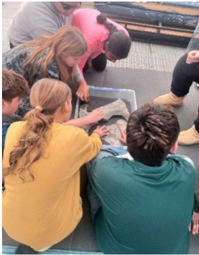
Checking out 3,000,000 years old fossils!