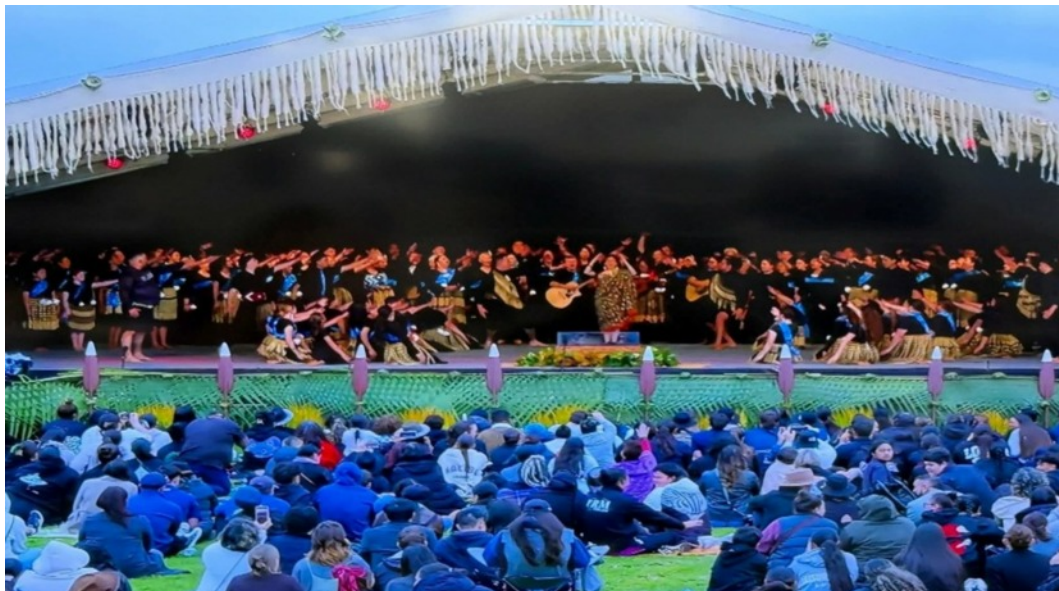
Ngāti Kahungunu Kapa Haka at the Koroneihana!

He pito kōrero is a space dedicated to celebrating and promoting Te Reo me ōna Tikanga Māori