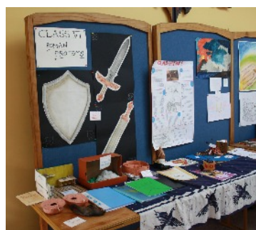
Class 6 display from their Ancient Rome Main Lesson